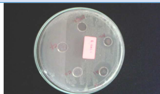
Photograph 3: Escherichia Coli