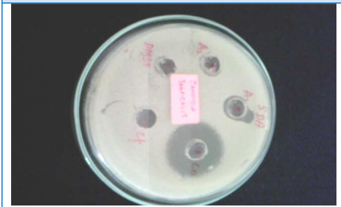
Photograph 6: Candida Tropicalis