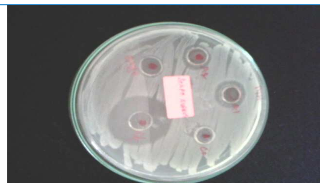
Photograph 1: Staphylococcus Aureus

Photos showing suspension of Ciprofloxacin, Clotrimazole and Abhraka Bhasma in DMSO solution.