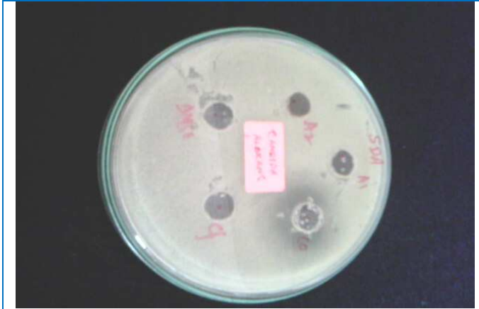
Photograph 5: Candida Albicans