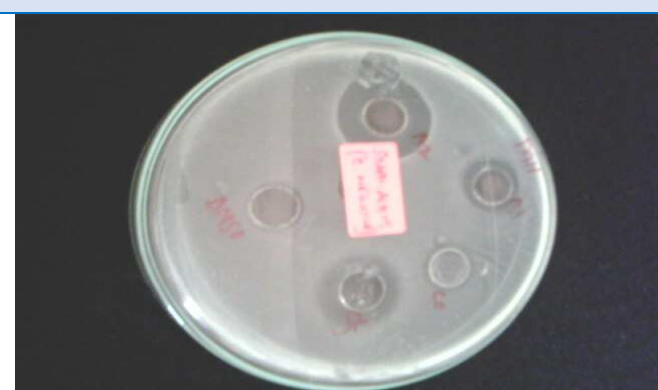
Photograph 2: Staphylococcus Albus