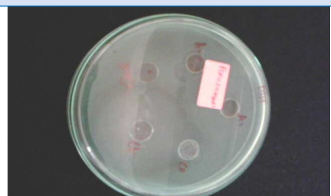
Photograph 4: Pseudomonas Aeruginosa